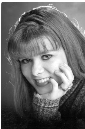
No! No hands to face.