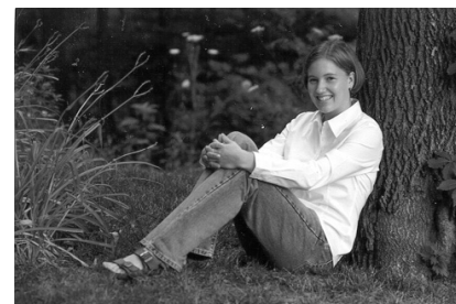
No! Wrong Orientation